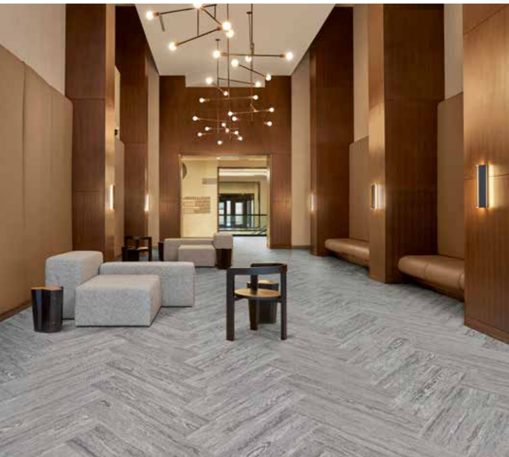
Plank 20 x 75 cm (7.87" x 29.53") - Installation pattern: Herringbone