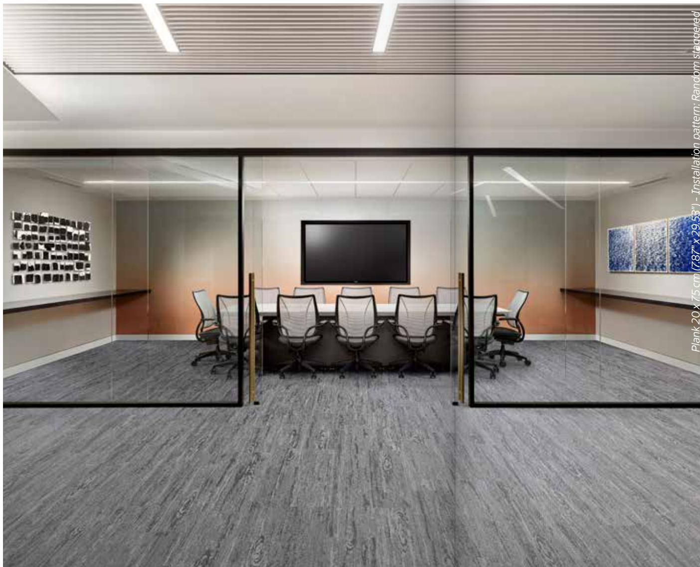
Plank 20 x 75 cm (787" x 29.53") - Installation pattern: Random staggered