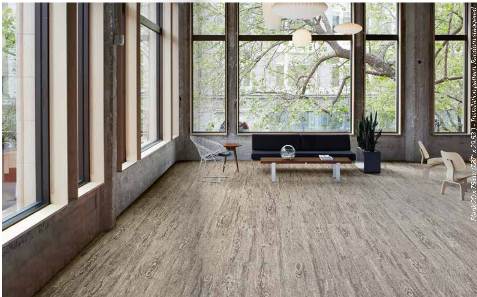
Plank 20 x 75 cm (787" x 29.53") - Installation pattern: Random staggered