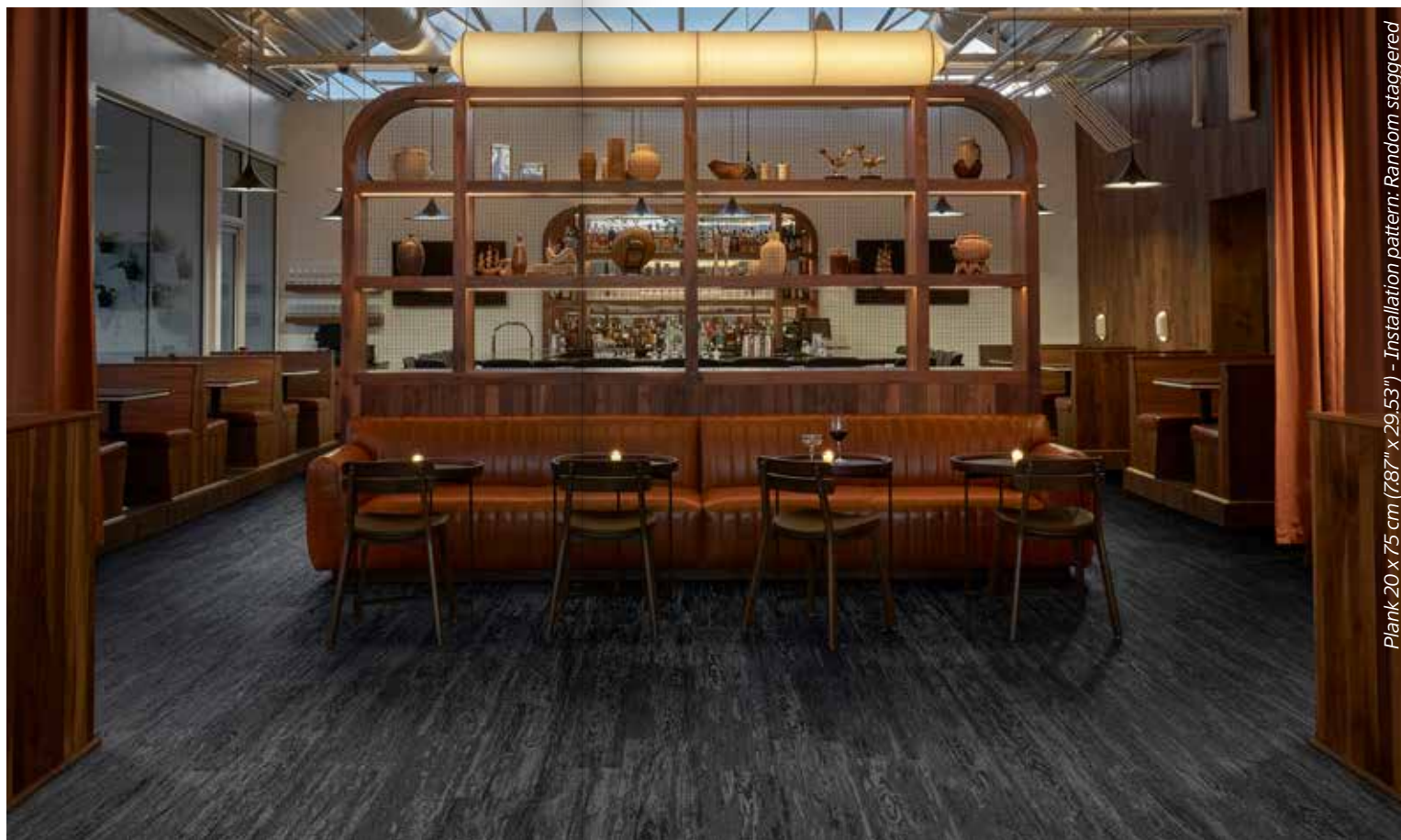
Plank 20 x 75 cm (787" x 29.53") - Installation pattern: Random staggered