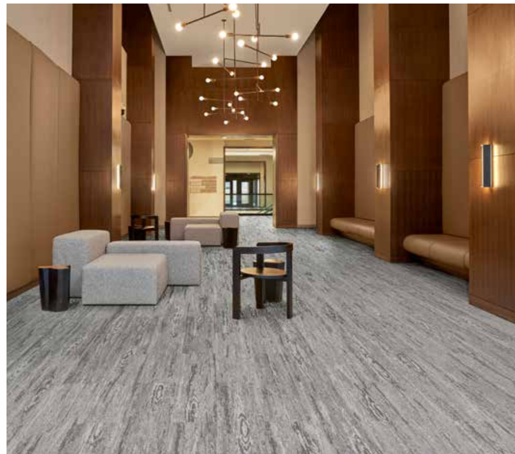
Plank 20 x 75 cm (7.87" x 29.53") - Installation pattern: Random staggered