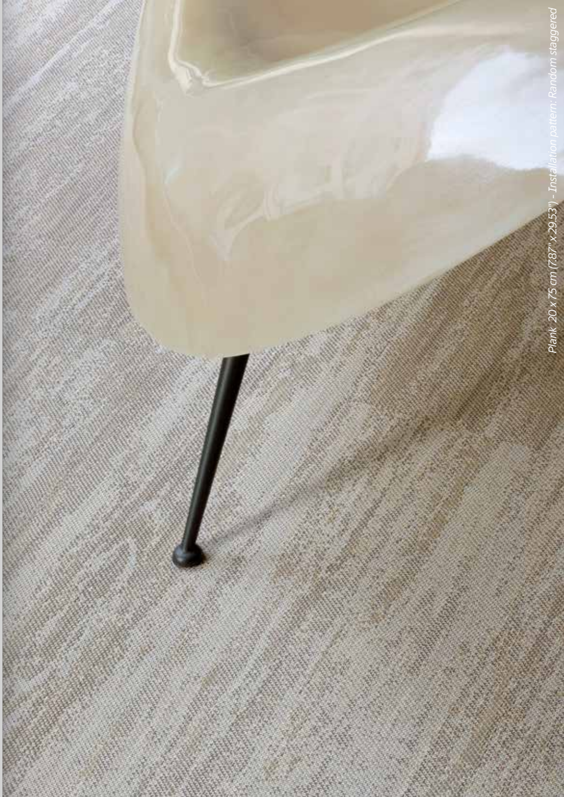
Plank: 20 x 75 cm (7.87" x 29.53") - Installation pattern: Random staggered